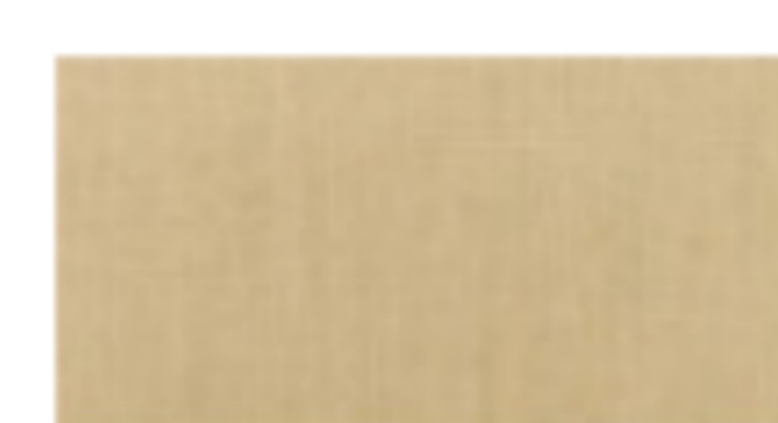
5476 Hearther Beige